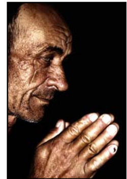
People in many cultures rely on faith healers rather than physicians to cure their illnesses.