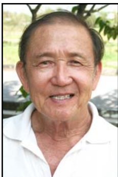
Traditionally, Chinese people with dementia are cared for by the oldest son and his wife.