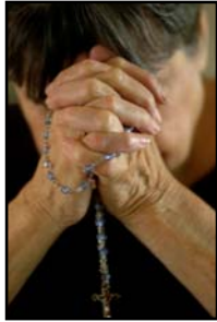
Many Hispanic Americans believe that stress plays a factor in the development of dementia.